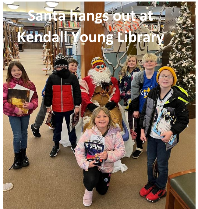
Santa hangs out at Kendall Young Library