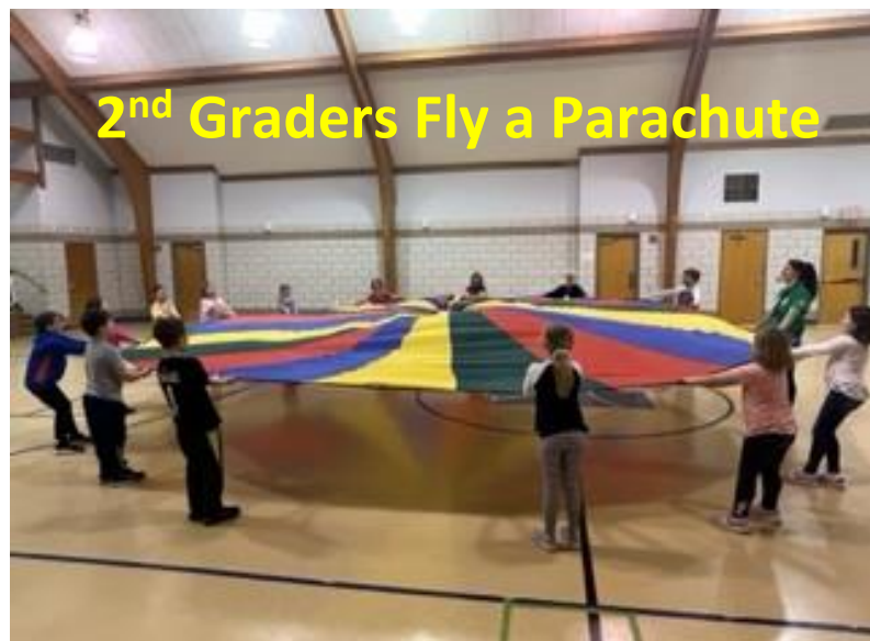
2 nd Graders Fly a Parachute

Nominations for the "Friend of St. Thomas" award: