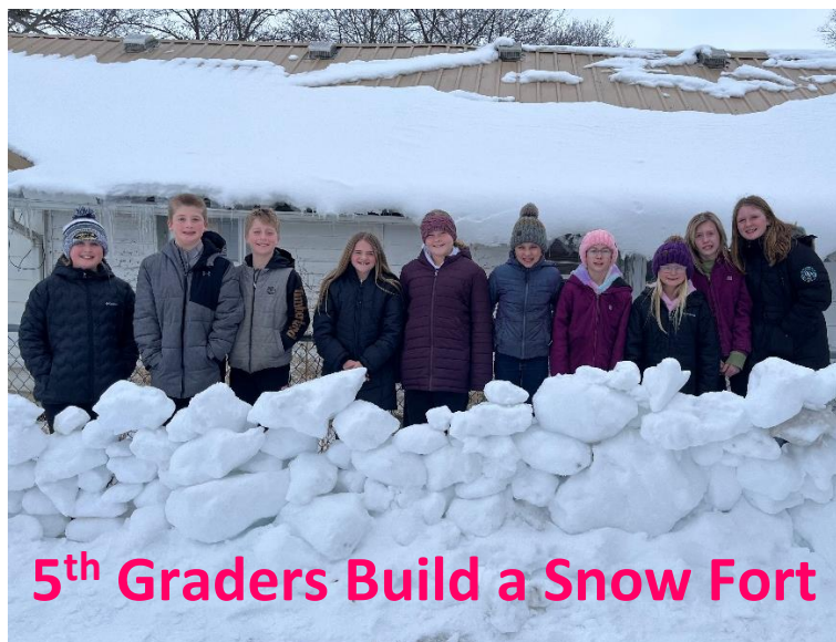
5 th Graders Build a Snow Fort

Loving to learn and learning to love all happening at STA School!