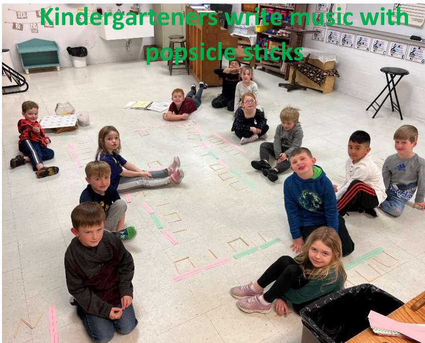
Kindergarteners write music with popsicle sticks